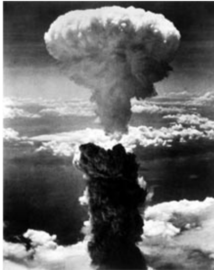
Nagasaki, Japan 1945