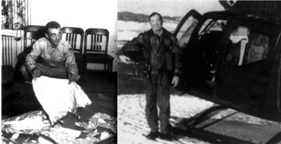
Credibility of Major Jesse Marcel and Jesse Marcel Jr.

(Always Telling the Truth Means Never Having to Remember Anything)