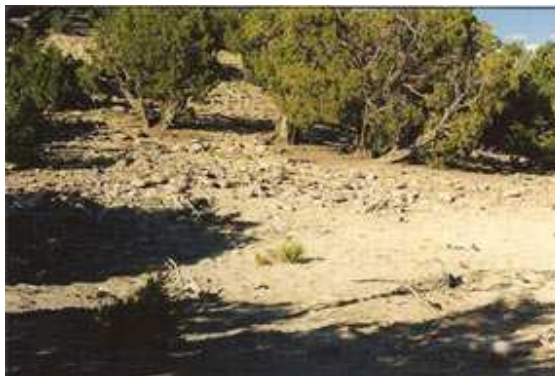
Aztec Crash Site

Roswell craft was discovered in many small pieces scattered over the Foster Ranch, and was estimated to be about 30-40 feet in diameter, while the Aztec craft appeared to make a forced crash east of Aztec in Hart Canyon with slight damage, and measured about 99 feet in diameter. Roswell's craft supposedly had 3-5 bodies, while Aztec's had 13. Both crafts are believed to have been recovered by the military with Roswell using the 509 th bomb wing from the Roswell Army Airfield, and the Aztec crash being recovered by a military unit from Colorado.