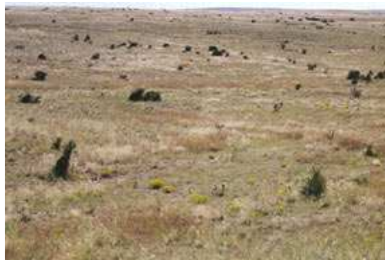
The Foster Ranch, Corona, New Mexico

Much has been written about the Roswell Incident of July, 1947 over the past 60 years, and while some researchers have written it off as a crashed balloon with crash test dummies, some of us continue to look for other explanations of what really happened, not believing the four excuses given by the military during those 60 years. New witnesses and information continues to be found about the Incident and that appears to be worth investigating, to determine what actually happened.