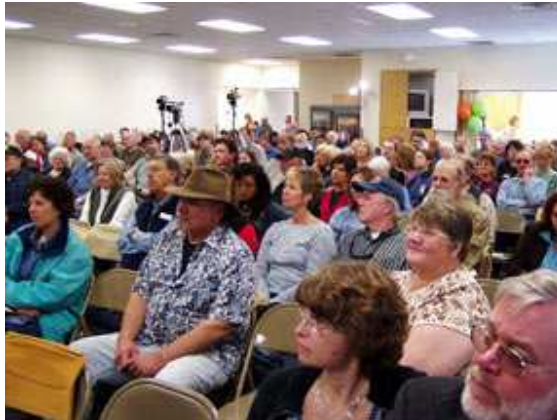
Aztec Symposium Audience