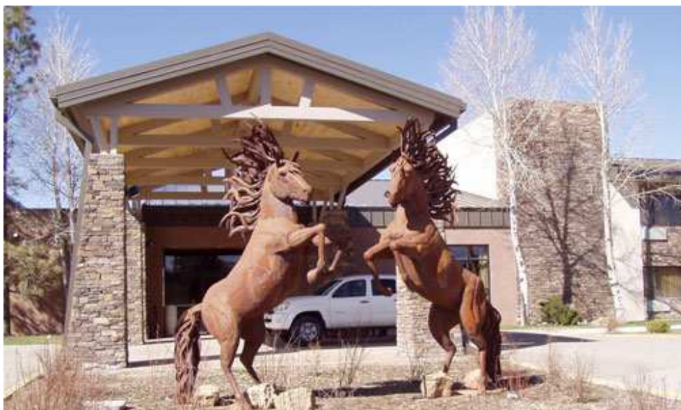
Best Western Jicarilla Inn & Wild Horse Casino

A few other incidents occurred that were not scheduled as part of the conference. A few minutes before 6 AM on the morning of the conference, I along with most other people in Dulce for the conference, and staying at the Jicarilla Best Western Inn, were awakened by the sound of at least one helicopter very low over the motel. Later it was learned that this was not normal, and no one knew where the helicopter(s) came from, whom they belonged to, or what they were doing so low over the motel. Apparently helicopters are not totally unusual in the area, but flying that low was unusual according to the locals who also heard it. It seemed to be a concern of some at the conference later that day.